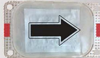
Custom Printing Available