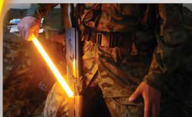
2 End Rings Impact