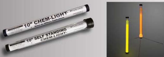
1 End Ring Non-Impact