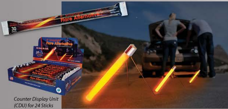
Counter Display Unit (CDU) for 24 Sticks