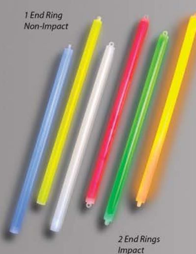
1 End Ring Non-Impact