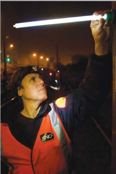
2 End Rings Impact